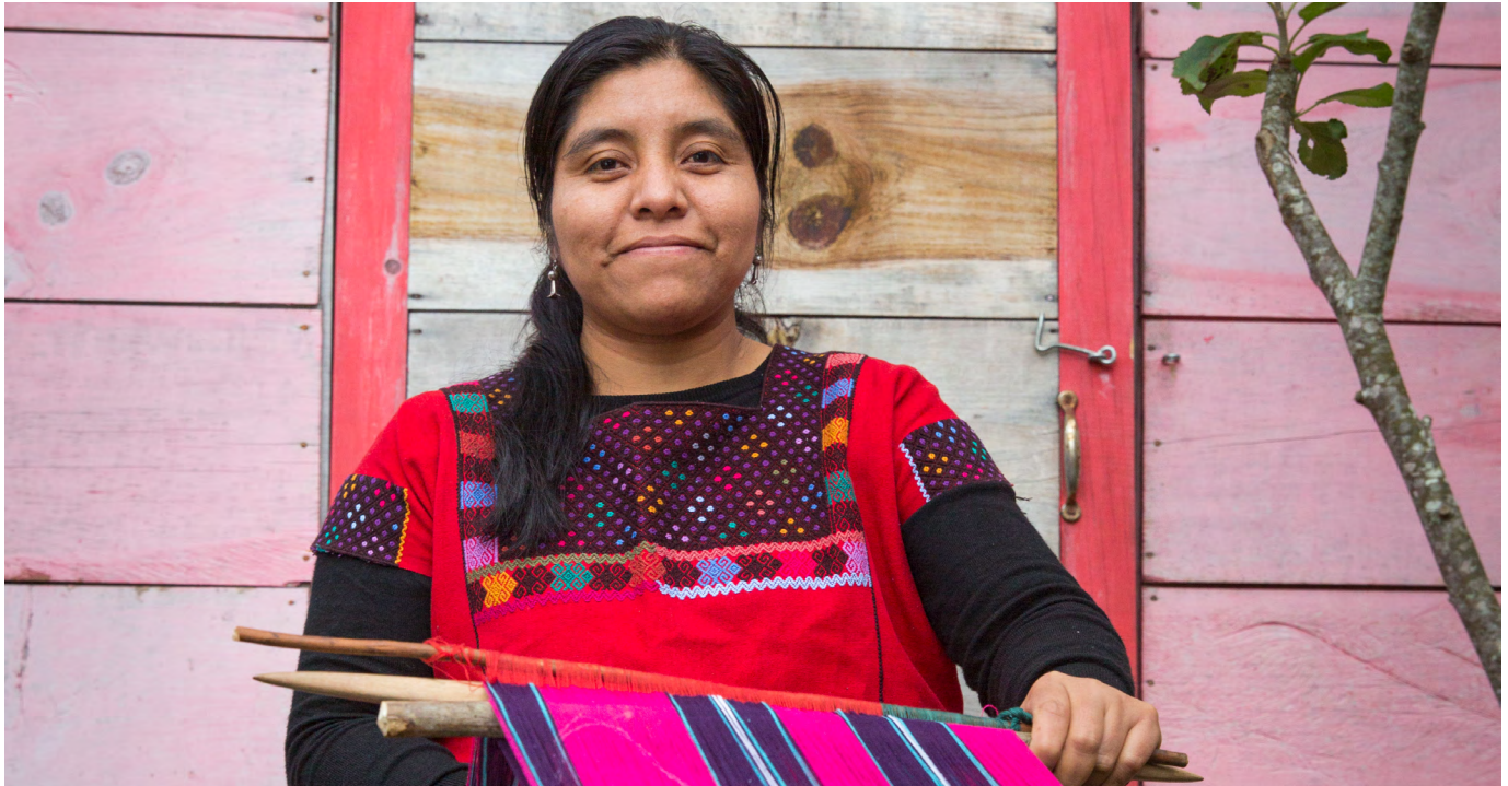
Across Mexico, LSF Worker Rights & Well-being grantee Fondo Semillas incubates grassroots efforts to advance labor rights and protections for women workers, with a focus on gender-based violence in the workplace.