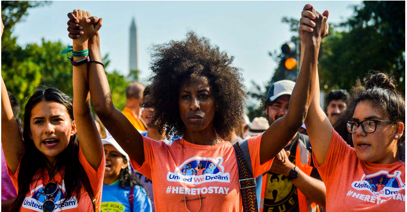
LSF Immigrant Rights grantee United We Dream , the largest immigrant youth-led network in the U.S., leads creative nationwide advocacy campaigns and organizing efforts to foster a culture that values immigrants and the progress they make possible.