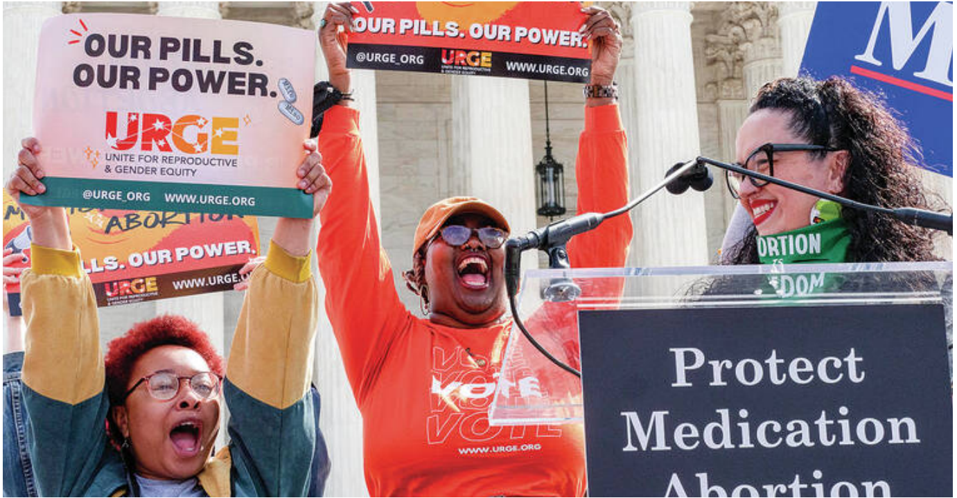
2024 LSF grantee URGE: Unite for Reproductive and Gender Equity trains youth to take action on reproductive justice through policy advocacy, culture change, and community organizing at the state- and national-level.