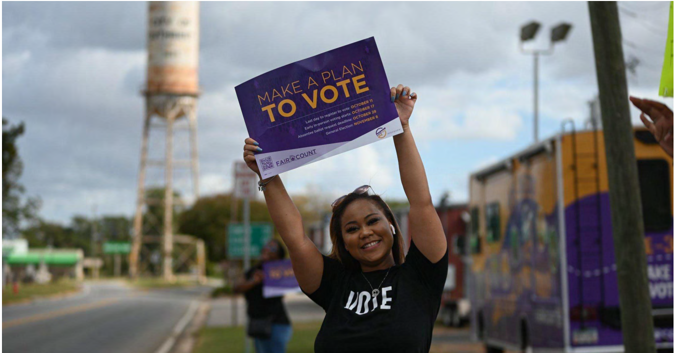
In the rural U.S. South, LSF Democracy grantee Fair Count engages historically underrepresented communities in the democratic process through ongoing mobilization, continuously activating new voters and local leaders to build long-term political power.